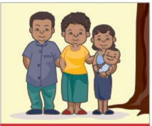
Practice your escape drill 2 times a year.